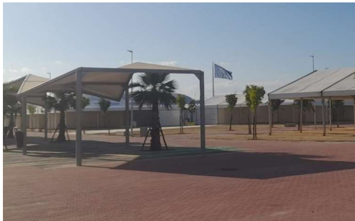
EL ABRAZO ENCLOSURE, EU FLAG

The areas with the highest level of completion are the large central square and the boulevard that runs east-west through the site. Around these two arteries are located the spaces that house the largest areas of green space and free esplanades that host the events held in the area.