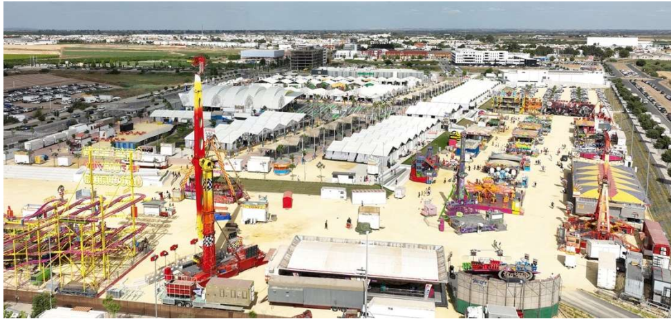
FAIR CELEBRATED IN "EL ABRAZO" ENCLOSURE