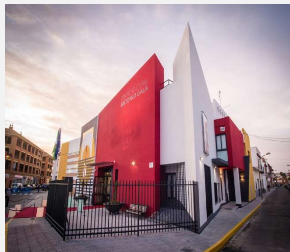
AFTER THE REFURMISHMENT