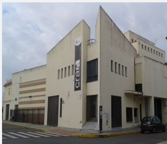
BEFORE THE REFURMISHMENT

The Antonio Gala Theatre was opened on February 10th, 1995. It was in a state of deterioration, with problems of accessibility for disabled people, safety problems in access due to the narrowness of the urban road, sanitary problems, unsustainable enclosures, leaks in the roofs, etc. Due to these circumstances, it was necessary for the Town Hall to intervene effectively to improve the conditions offered to both artistic and creative entities and the public in order to be able to hold cultural and artistic activities. By creating this new scenic space with a modern and functional design, the municipality aims to complete its "great cultural ring," facilitating the connection between creators and the public to whom they are addressed, to develop, promote, or host activities in different areas of culture in any of its manifestations.