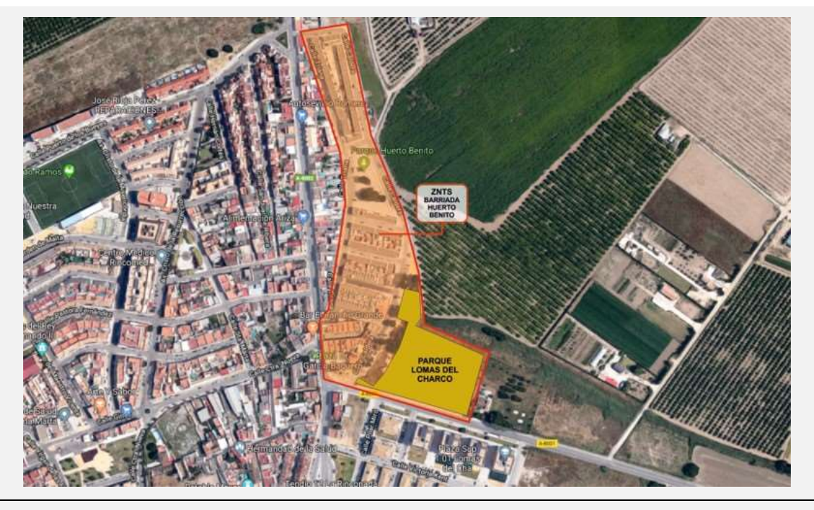
LOCATION OF THE PARK IN THE AREA OF "HUERTO DE BENITO" NEIGHBOURHOOD (ZNST)

act as a real environmental lung. In addition to this, there was a lack of sports and leisure areas, and the facilities included in this park have come to cover the following.