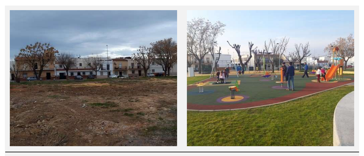
BEFORE THE ACTION

In these disadvantaged neighbourhoods, which originate in social housing developments whose population has the worst socio-labour situation (trapped by unemployment, casualization and lack of education), an effective intervention is needed to improve these communities and integrate them with the rest of the municipality. For this reason, the Town Hall designs social intervention programmes to prevent poverty and social exclusion, reduce social inequalities and increase training, which is one of the main reasons why this new green and leisure area will be created.