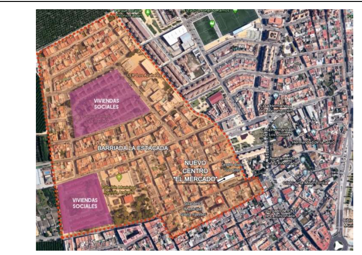
LOCAL MARKET LOCATION.

2.5. High degree of coverage of the population. Mention is made of the outreach, not only to beneficiaries but also to the general population.