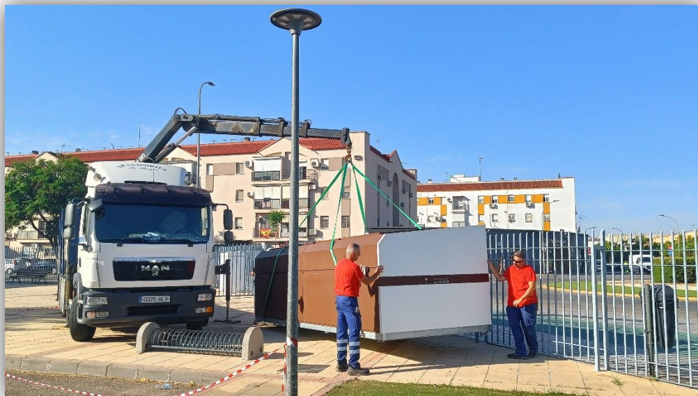
12. INSTALLATION OF THE POD NEAR THE LOCAL INDOOR POOL