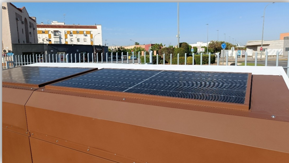
10. PHOTOVOLTAIC PANELS ON THE ROOF OF THE POD LOCATED NEAR THE INDOOR POOL