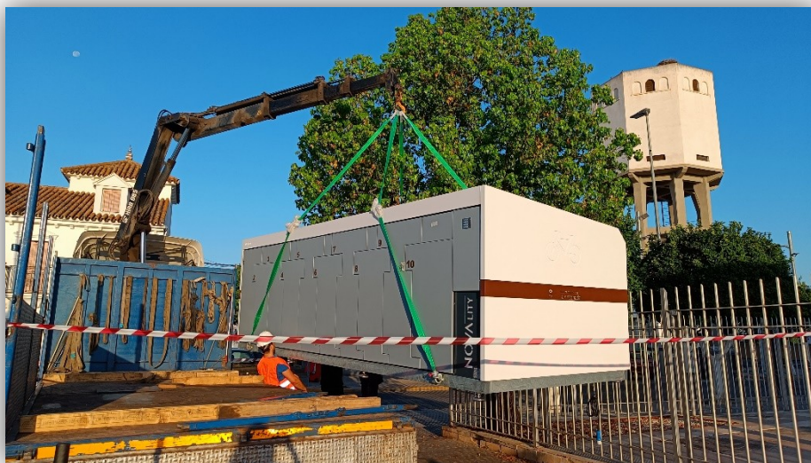
11. INSTALLATION OF THE POD NEAR THE TOWN HALL