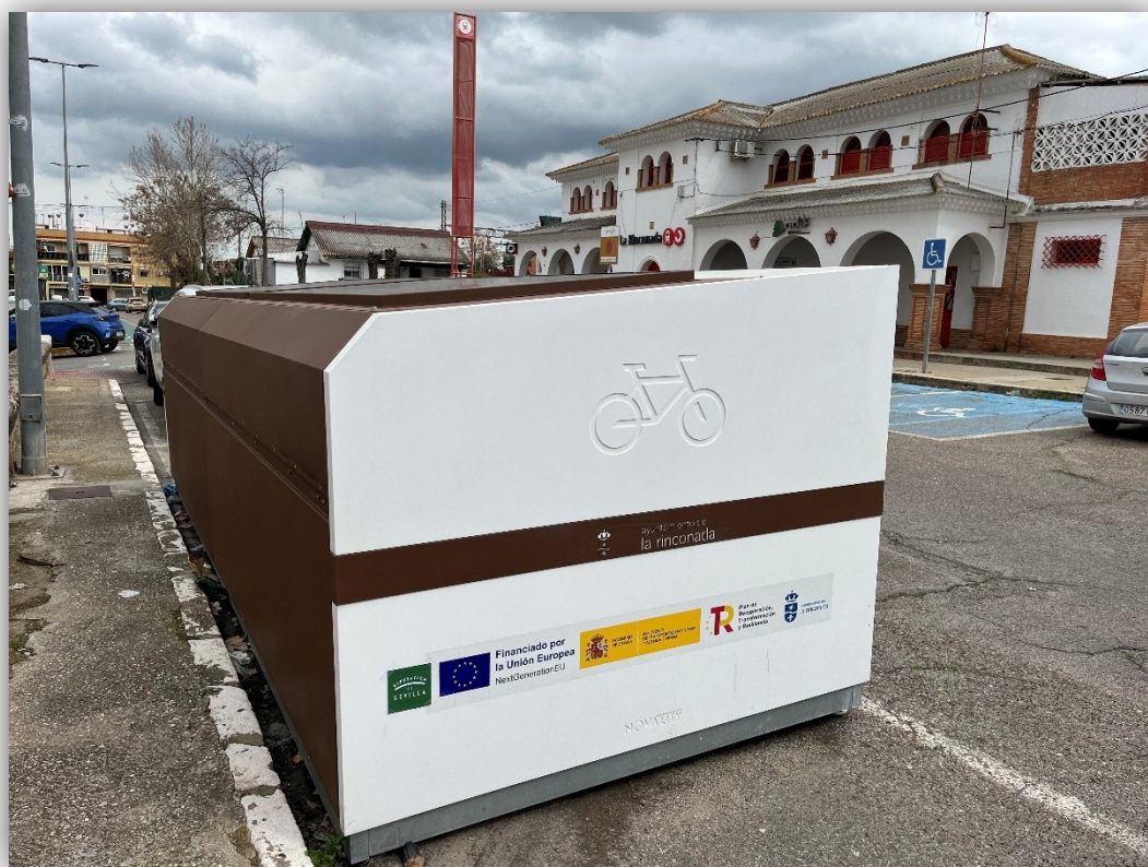
13. LOGOS DISPLAYED ON THE PARKING POD