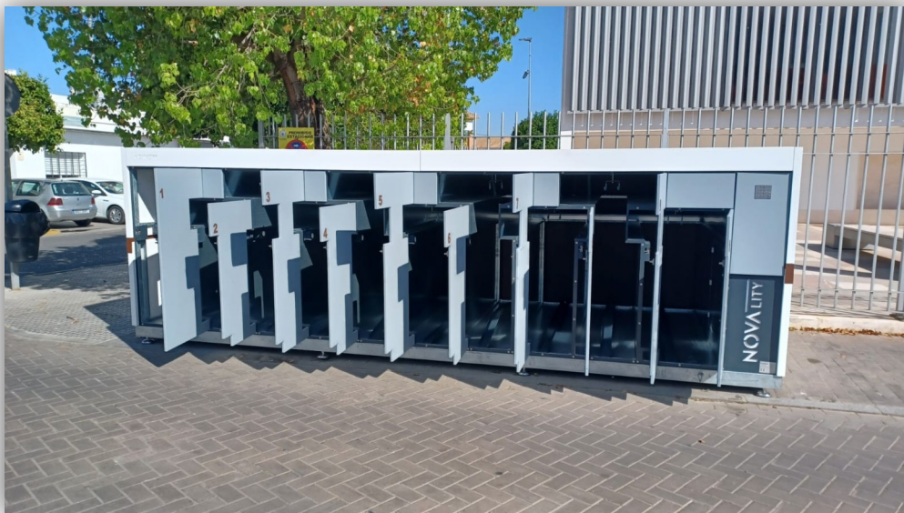
6. PARKING POD WITH ITS DOORS OPEN, SHOWING THE INTERIOR