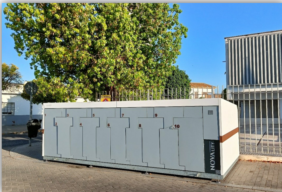
14. ORIGINAL LOCATION OF THE POD NEAR LA RINCONADA TOWN HALL