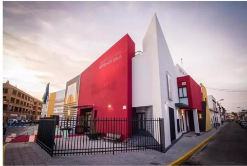
El Centro Cultural Antonio Gala de La Rinconada - AYUNTAMIENTO DE LA RINCONADA