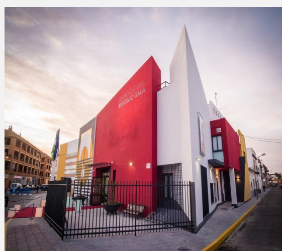
AFTER THE REFURMISHMENT

The total investment in this action has been 800.351,55 €, of which 384.000,00 € corresponds to the ERDF co-financing. The impact of the action is reflected, on the one hand, in the adaptation of the “Antonio Gala” Cultural Centre and its adaptation to the current demand for use and the need to renovate these obsolete facilities, and on the other hand, in the use and enjoyment by the citizens of La Rinconada of this theatre, as they had previously been deprived of access to nearby cultural services.