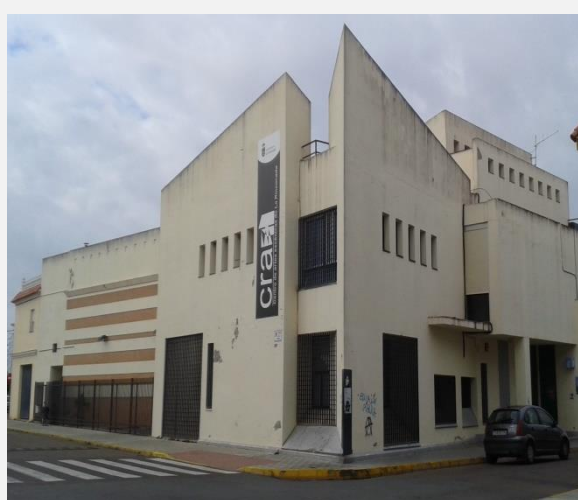
BEFORE THE REFURMISHMENT

The Antonio Gala Theatre was opened on February 10th, 1995. It was in a state of deterioration, with problems of accessibility for disabled people, safety problems in access due to the narrowness of the urban road, sanitary problems, unsustainable enclosures, leaks in the roofs, etc. Due to these circumstances, it was necessary for the Town Hall to intervene effectively to improve the conditions offered to both artistic and creative entities and the public in order to be able to hold cultural and artistic activities. By creating this new scenic space with a modern and functional design, the municipality aims to complete its "great cultural ring," facilitating the connection between creators and the public to whom they are addressed, to develop, promote, or host activities in different areas of culture in any of its manifestations.