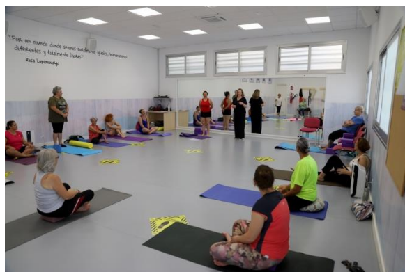
PILATES ACTIVITY IN THE SUMMER SCHOOL “GROWING TOGETHER”, C.C. “LOS SILOS”.

The "Los Silos" Civic Centre is hosting many activities within the framework of the "Programa Mujer-Es", a programme of activities of the Department of Equality, promoting a plural, creative, claim and transformative feminism. One of the most outstanding activities is currently being carried out in the Summer School "Growing Together", offering yoga and pilates workshops to the users, which work on the autonomy and health of local women.