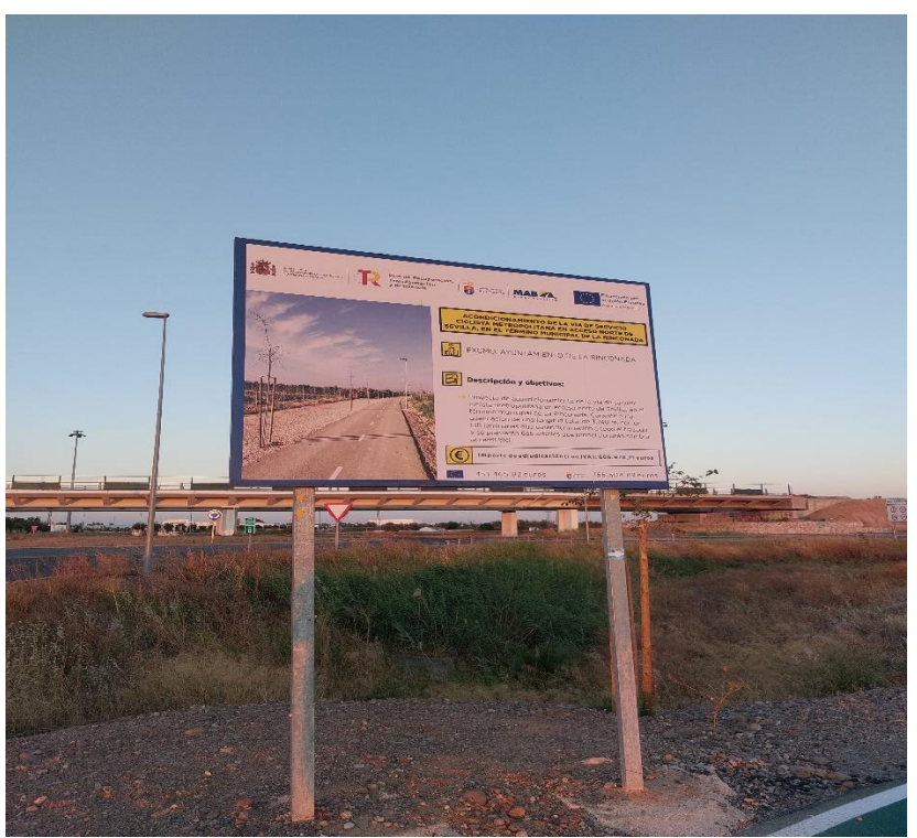
1.CONSTRUCTION SIGN FOR THE METROPOLITAN BIKE LANE