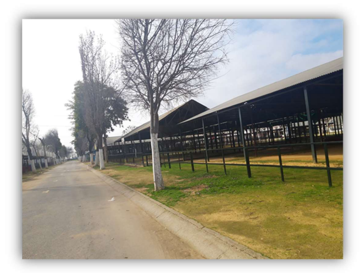
6. BEFORE THE WORK II (OLD FAIRGROUNDS)