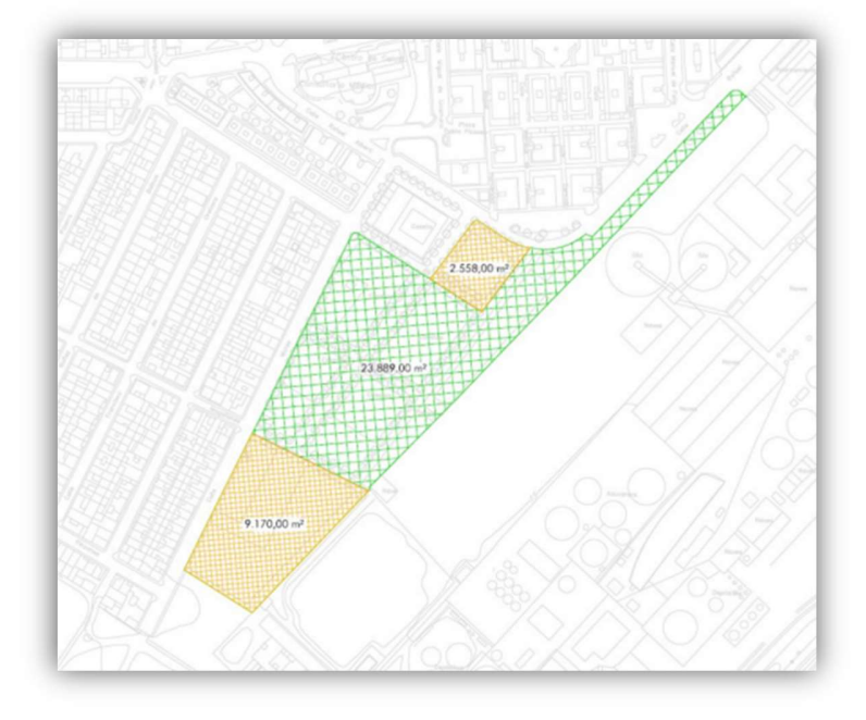
4. PLAN OF THE SANTA CRUZ PARK