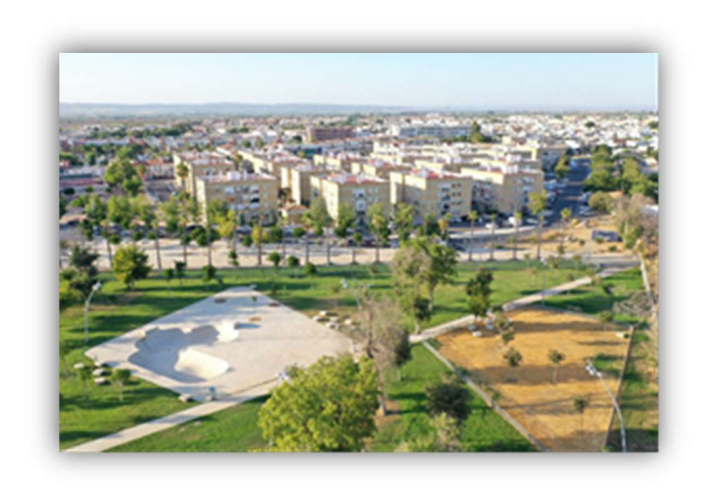
10. AFTER THE WORK III